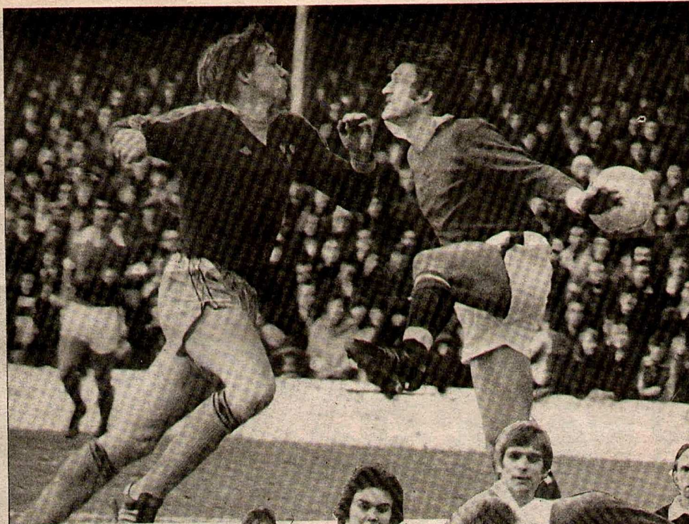
Walsall 3, Shrewsbury Town 0