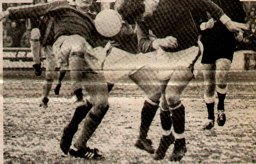
STAR SOCCER VIEW BY GARY NEWBON